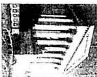
The U.S. Supreme Court in Washington, DC

Article III creates the Supreme Court and authorizes Congress to create federal courts below the Supreme Court. These are courts that deal with United States laws, not state laws. Article III also gives directions about what kinds of cases the Supreme Court and federal courts can hear. Under Article III, federal judges are appointed, not elected. They stay on the bench until they retire, die, or are removed for bad behavior. Article III also guarantees trial by jury for criminal cases and explains the crime of treason.