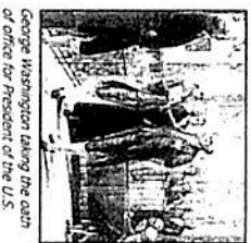
George Washington taking the oath of office for President of the U.S.

Federalism is the idea that the national government shares power with the state governments. But what happens if a state law disagrees with a national or federal law? Article Six states that the laws and treaties of the U.S. government are "the supreme law of the land." If a state law disagrees with a federal law, federal law wins. This article also requires officials working in the state and federal governments to take an oath to support the Constitution no matter what.